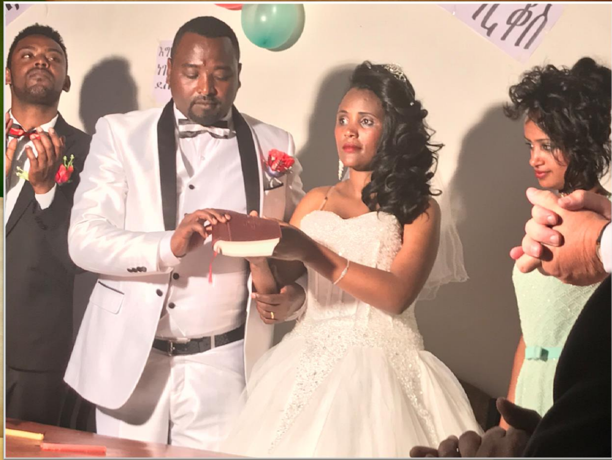
Aburro & Sissai