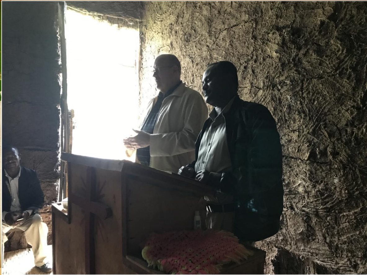
Preaching at Hosanna