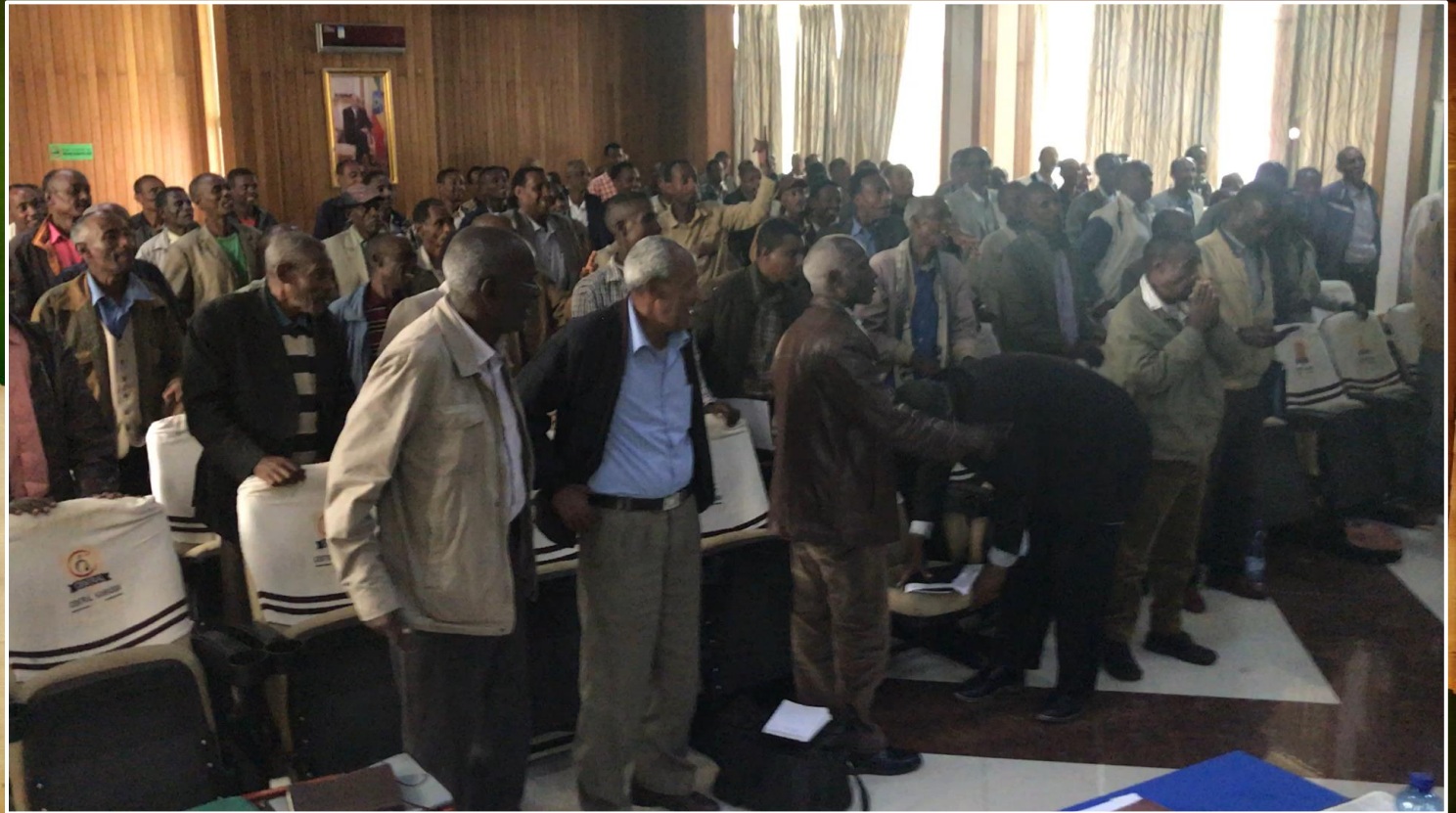
Classes in Awassa