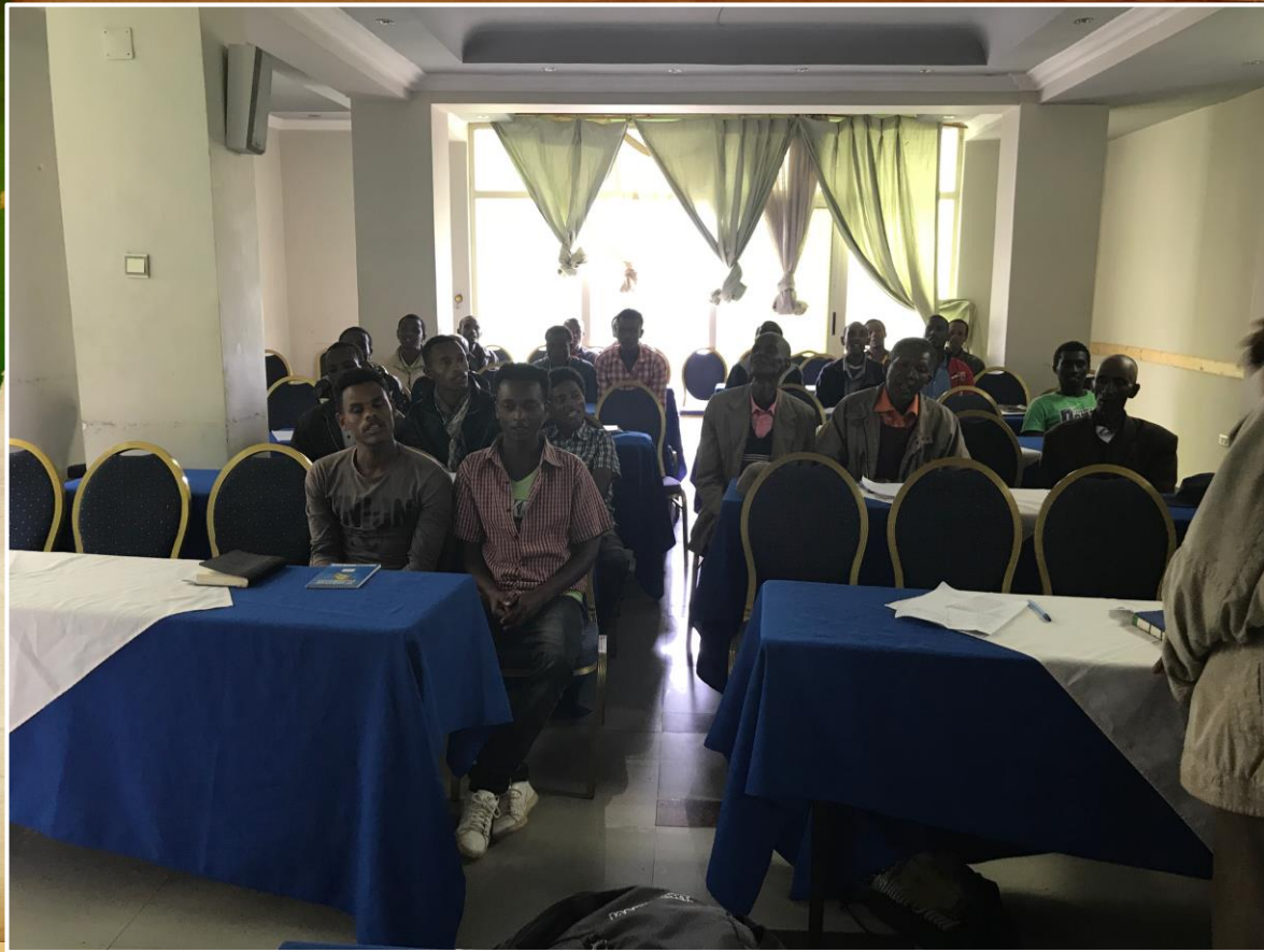
Smaller class in Awassa