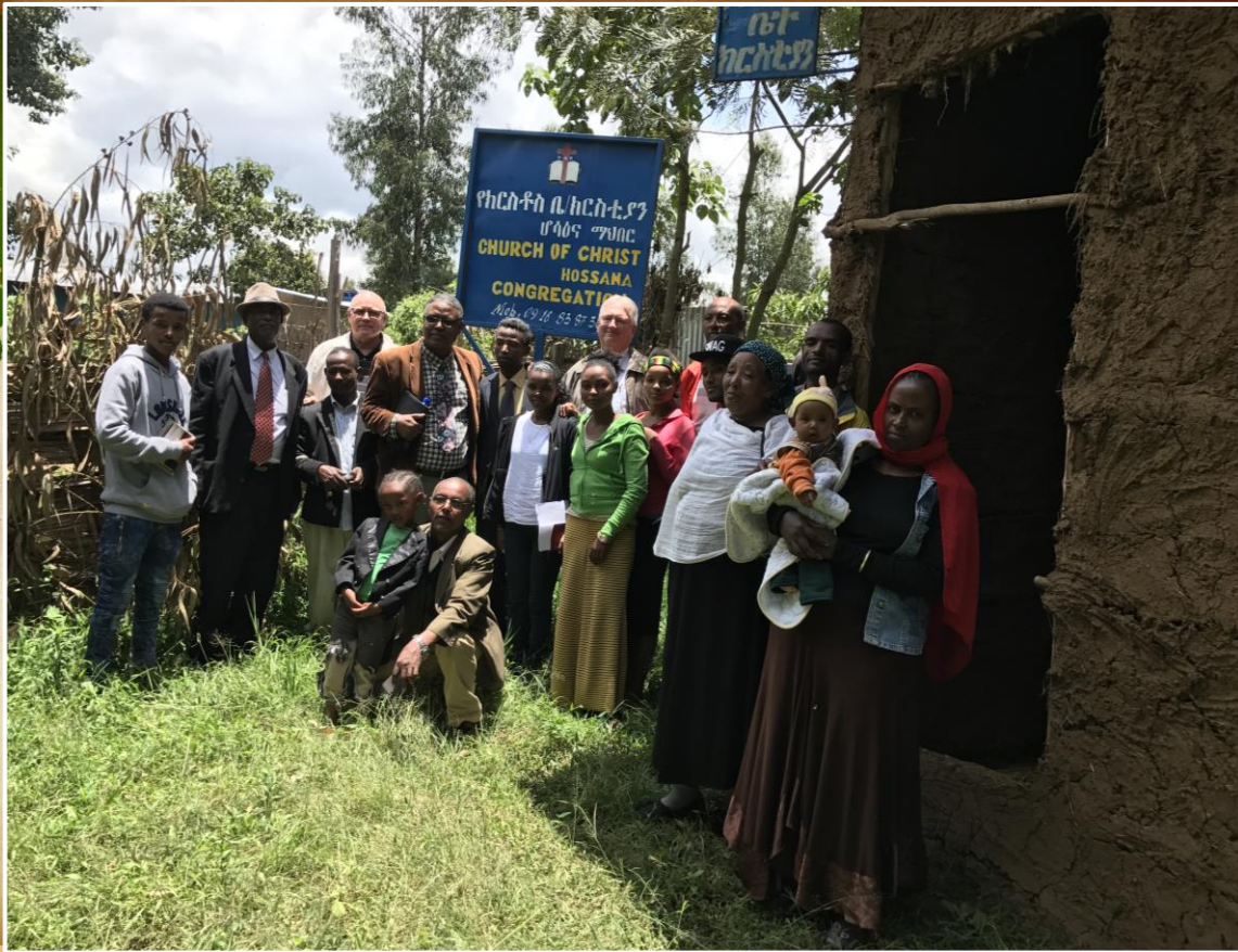
Hosanna Church Of Christ