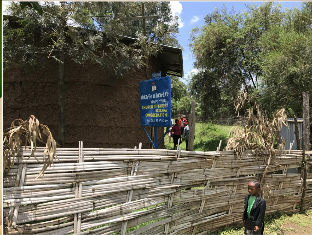
Preaching at Hosanna