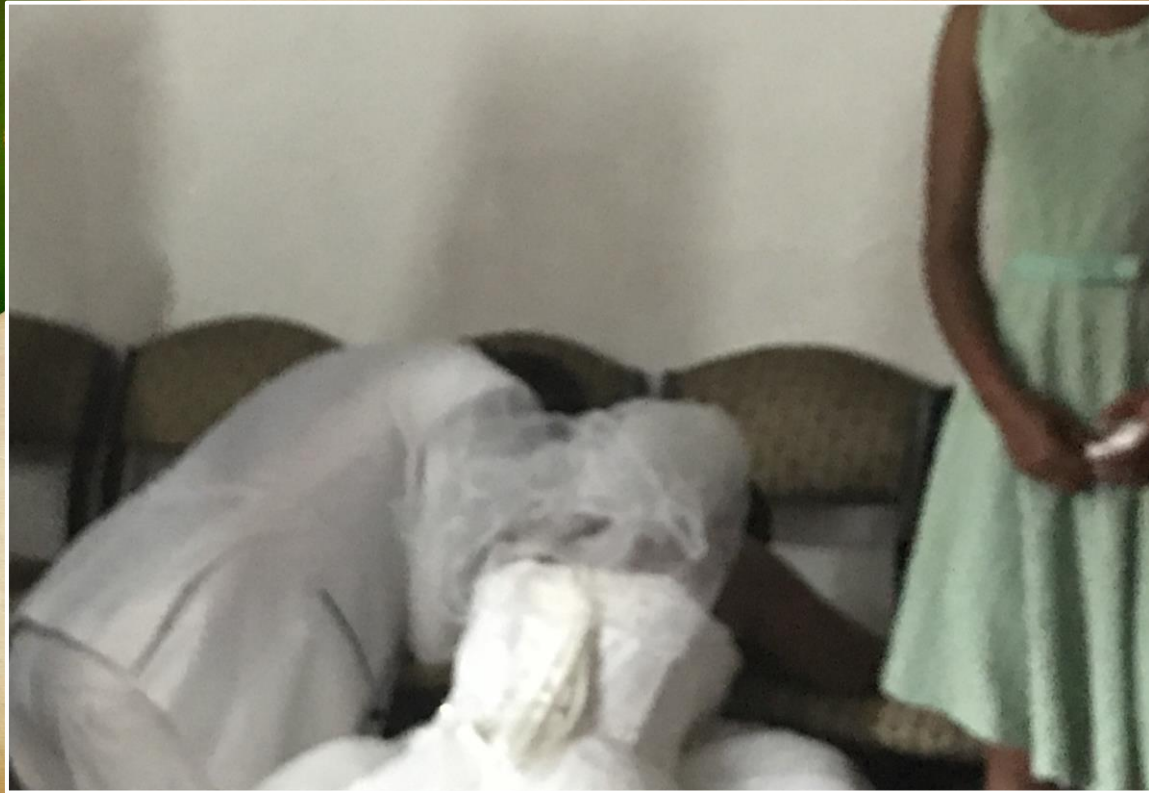
Kneeling in Prayer