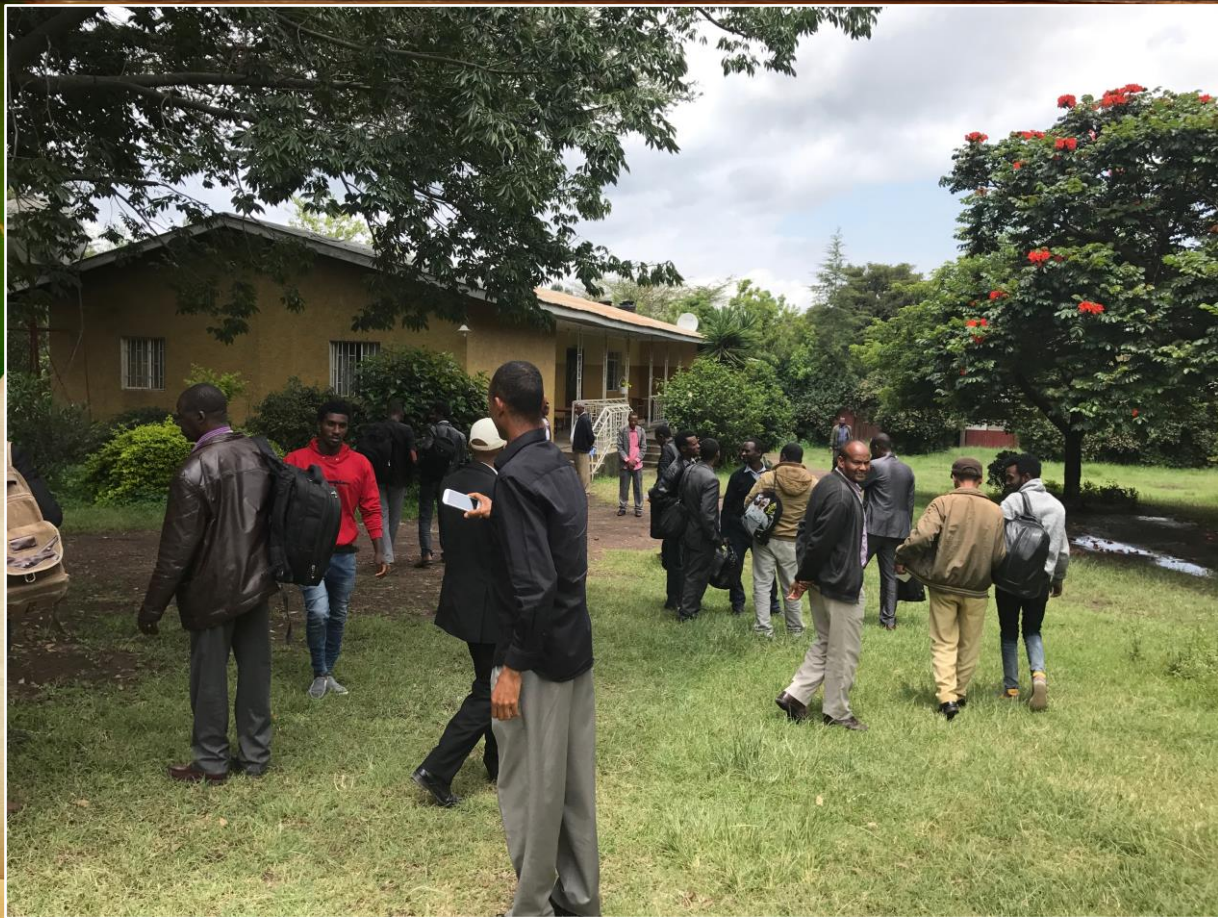
Teaching at Debra Zeyt