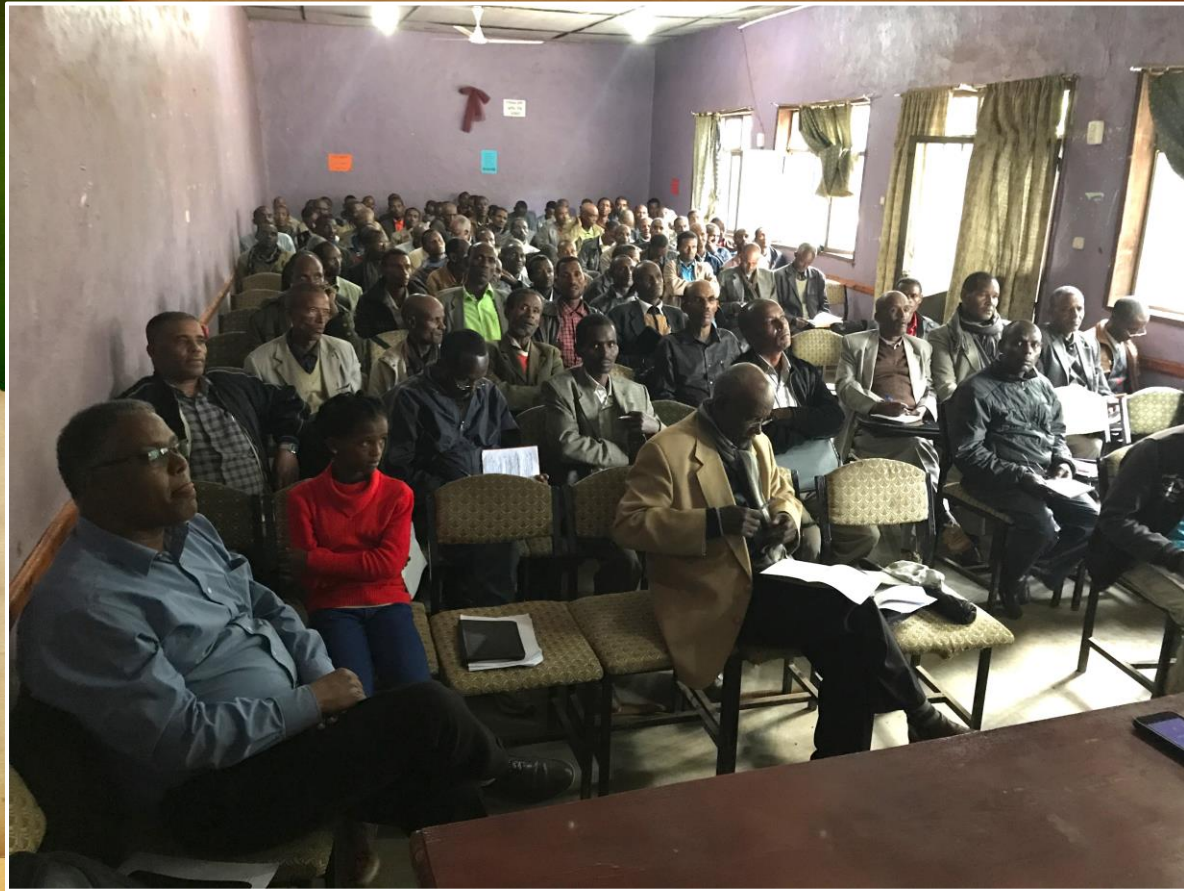
Hosanna Class 1