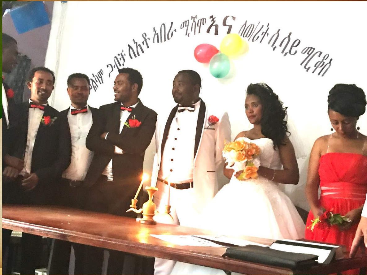
The Wedding - Hosanna